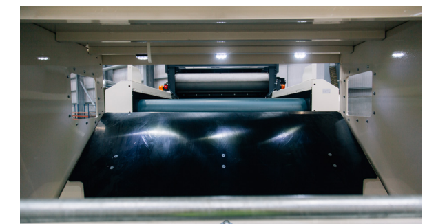
22 pole neodymium eddy current rotor surrounded with an ultra-thin carbon fibre shell to maximise non-ferrous metal recovery