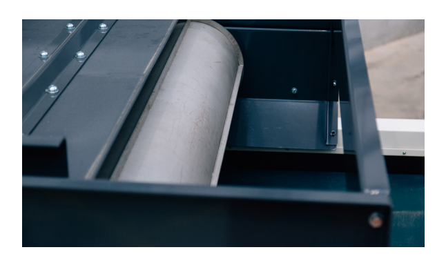
Variable speed 2m (6'7") wide high strength neodymium radial pole drum for optimal ferrous metal recovery