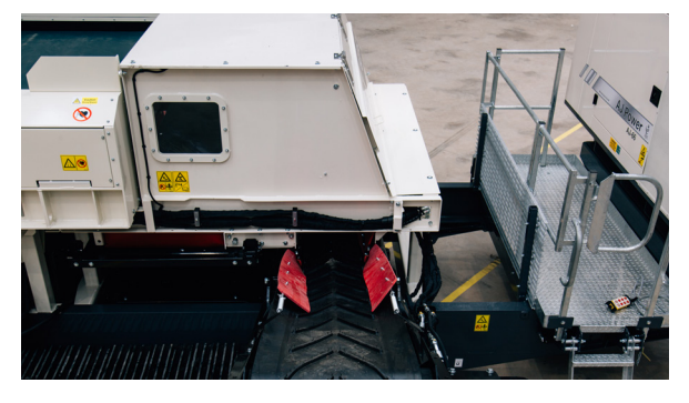
Movable splitter box allowing optimal material flow whilst enabling the machine to fold within 3m wide transport width