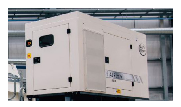
Low noise 60kVa generator offering excellent fuel consumption and serviceability