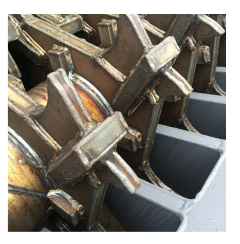
Shaft cutting elements are a fully welded structure with hard-faced edges giving ultimate strength in difficult applications

Robust German designed shredding chamber Independently driven shafts give excellent shredding performance in even the most