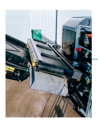
High strength overband magnet with hydraulic height adjustment (Optional)