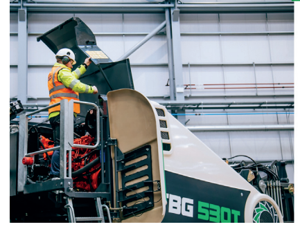
Unrivalled service access for daily checks and maintenance